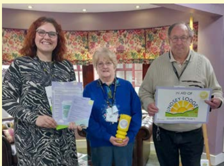
Epworth Old Hall