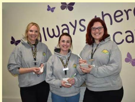
Lindsey Lodge Meet & Eat Restaurant