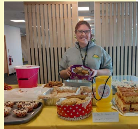
Nisa Locally Partner Support Centre