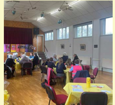
Burton Village Hall