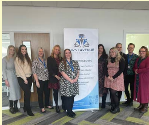
First Avenue Training Ltd