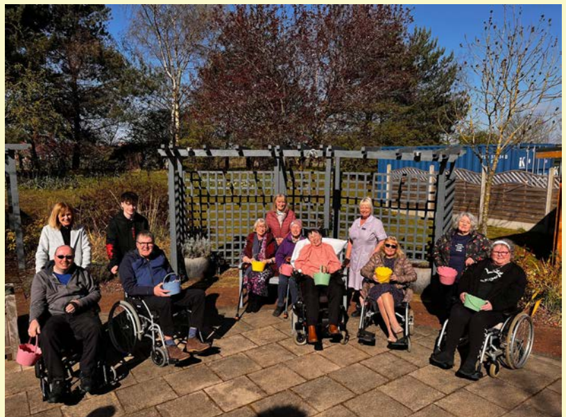
Our patients enjoyed the sunshine and had great fun on their Easter Egg Hunt