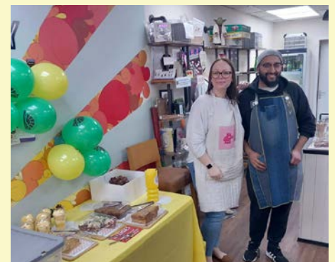
Three B's Bakes at Moe's Caffe Society